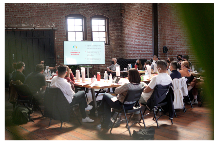
First Annual Convening of CZI's Housing Narrative Partner Program: April 2022

From our program's start, we consistently heard from our housing partners across California about the need for a more effective, longer-horizon statewide narrative approach that would help them make progress and ultimately win on housing reform across the state. This new narrative approach needed to connect and unpack parallel narrative threads such as the government's role in housing, how people experience the economy, perceptions of who belongs and who is deserving in our communities, and ideologies about who has the power to make decisions and be involved.